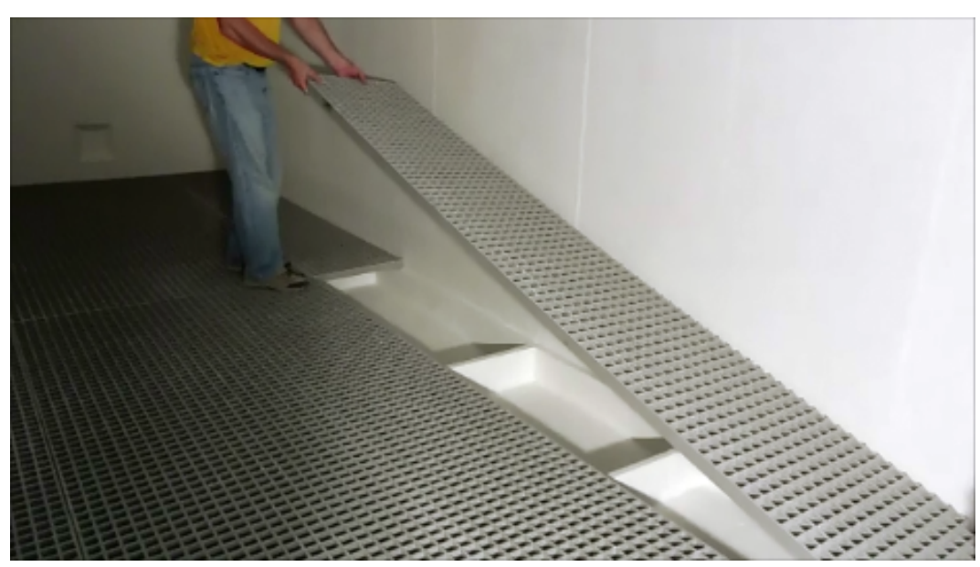
Sectioned area of containment floor to sit below shower area

Another interesting element of this shelter is that it included an emergency shower for the safety of the workers. The shower stall needed to have a hole that would drain water from the shower out (as opposed to the containment floor, which is meant to keep fluid in). In order to accomplish this, the subfloor was divided into two separate sections and the contained area under the shower included a drain to flow the shower water out.