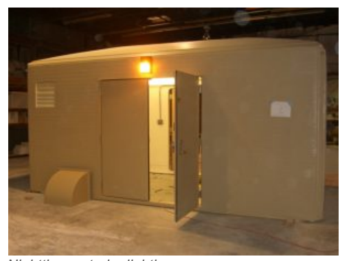
Nighttime exterior lighting

Skylights — Skylights are a great alternative for bringing light into the shelter. They are a translucent area of fiberglass with no foam or wood. They are created during