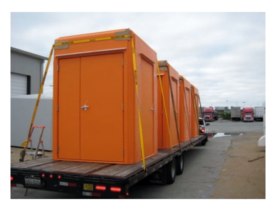
Safety orange-colored shower shelters