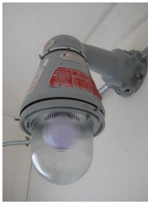
An explosion-proof fluorescent light

Explosion-proof electrical packages – Class I Div I and Class I Div II electrical packages are available for projects when flammable gases or vapors are or may be present.