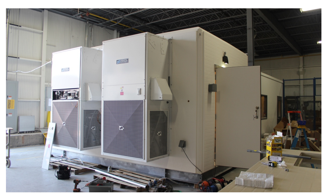
Wall-mounted air conditioning units