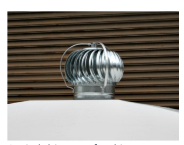
A wind-driven roof turbine